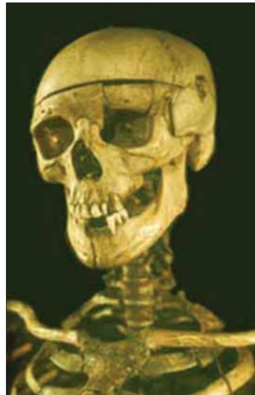
William Burkes skeleton

The names of William Burke and William Hare from Northern Ireland have become synonymous with body-snatching due to their activities in the slums of Edinburgh in 1827. It all began when a fellow lodger died and they sold his body to Dr Robert Knox the famous anatomist and lecturer. In less than a year they had supplied at least 16 cadavers to him, however they were not Resurrectionists, but murderers. They would entice victims into their abode with the offer of drink and hospitality, when the guest was suitably intoxicated, Burke would employ his own particular method of killing leaving no discernible marks on the body which would otherwise reduce their value. Hare would come from behind and suffocate the victim by placing his hands over the mouth and nose while Burke sat on his/her chest. This method of murder subsequently became known as “Burking”.