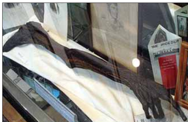
Dan Donnelly's mummified right arm displayed in the Hideout Bar