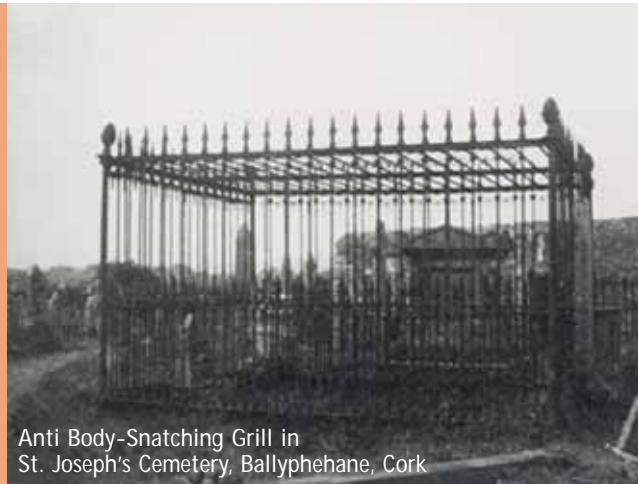
Anti Body-Snatching Grill in St. Joseph's Cemetery, Ballyphehane, Cork

The clandestine entering of graveyards on dark windy nights, guided by the flickering flame of a hand held lantern, casting shadows all about, is not for the faint hearted, when, as all policemen know, the powers of evil are exalted in the nighttimes. In late 18 th and early 19 th century Ireland, nocturnal entrepreneurs, who were both feared and despised by their fellow man, earned their living in these eerie surroundings, at a time when Rest in Peace was never guaranteed—enter Body-Snatchers and Grave Robbers, more colloquially known as –“ Sack-‘em –ups” and “Resurrectionists”.