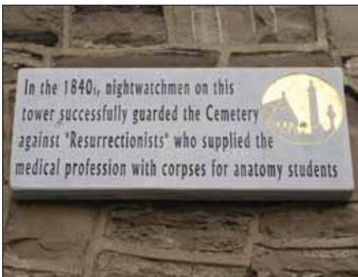
Plaque on watchtower in Glasnevin graveyard

robbing, e.g., mixing straw with the covering soil to make digging difficult, placing heavy stone slabs over the grave, installing cages, paying watchmen, or erecting watch towers. The situation became so bad in the Prospect Cemetery, better known as Glasnevin Cemetery or to the Dublin wit as "The Dead Centre of Dublin" that five watchtowers were erected strategically around the perimeter walls in 1842 and watchmen with bloodhounds were employed. Some families preferred to guard their own, on one famous occasion this led to what the newspapers referred to as the "Battle of Glasnevin Graveyard".