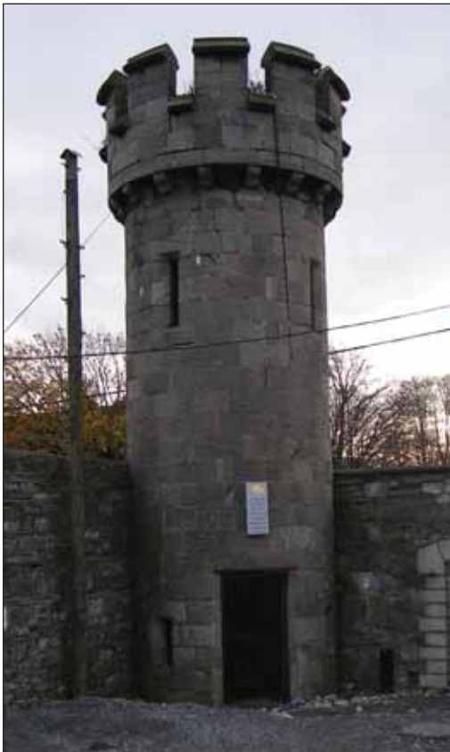
Watchtower in Glasnevin graveyard in Dublin