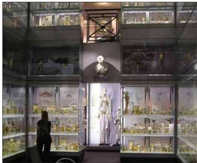
Skeleton of the "Irish Giant" on display in the Royal College of Surgeons, London.