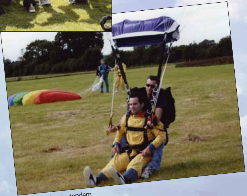
Safe landing in tandem