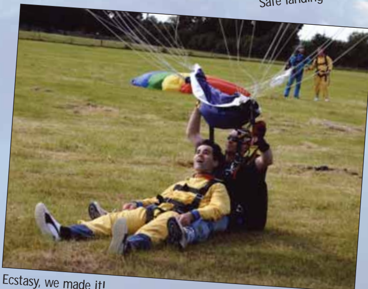
Ecstasy, we made it!