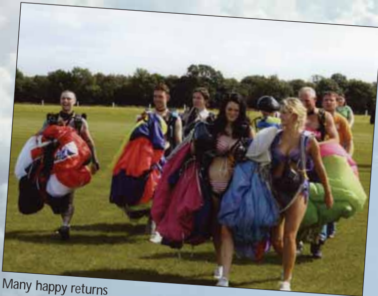
Many happy returns