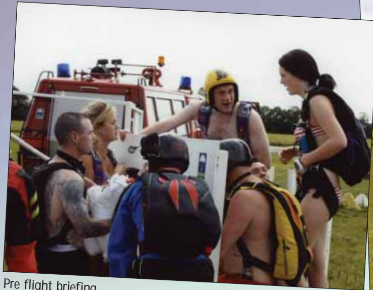
Pre flight briefing