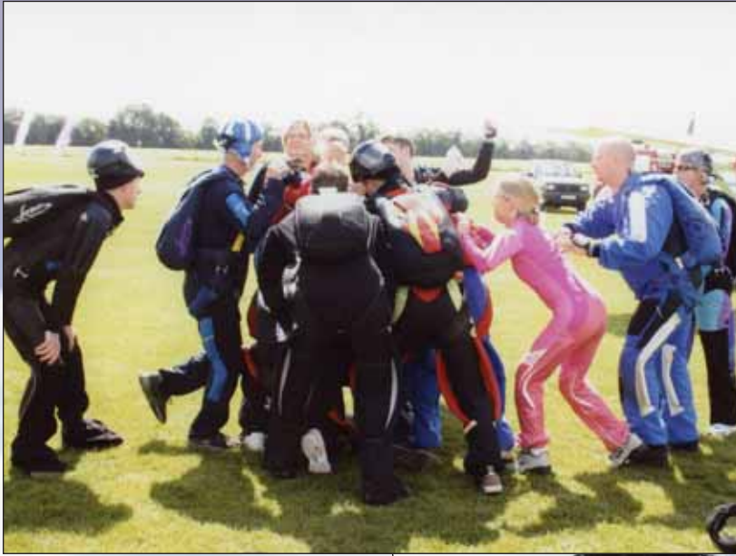
Pre flight formation briefing