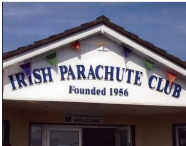
Entrance to the Club House