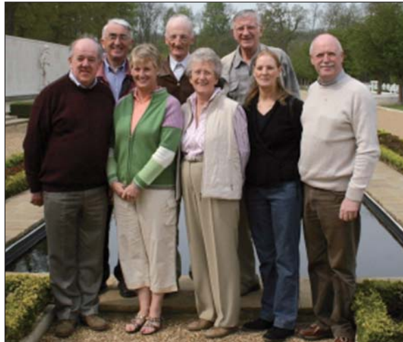
Group of IPA/Rotarian members at US War Cemetery, Cambridgeshire.