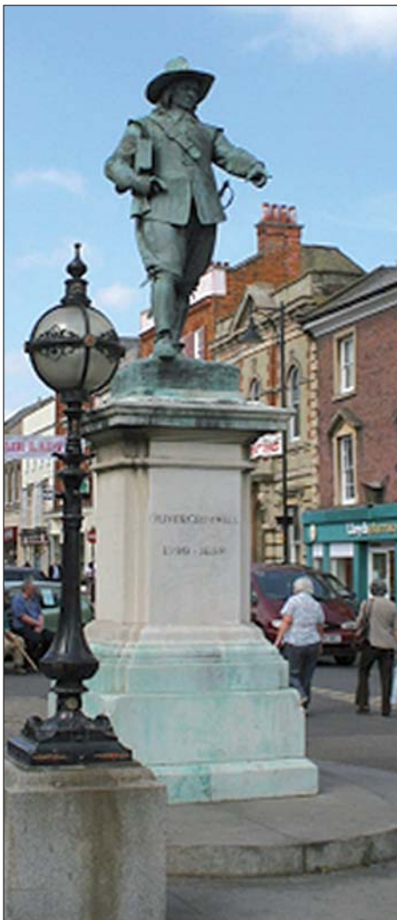
Oliver Cromwell's Statue in St. Ives

I enjoyed a very pleasant visit recently to a lovely little town in Cambridgeshire called St Ives displaying something that you will not find anywhere in Ireland or in England either. I write of a large statue of Oliver Cromwell who hailed from nearby Huntingdon, some 9 miles from St Ives; a man for whom, even in his homeland, there were very mixed feelings, ranging from extremely good to extremely bad and I'm told that when the time came to erect this statue there were mixed views as to whether he should be honoured or not. The story goes that when the monument was proposed in his honour his home town was having none of it and St Ives took on the task. While there has been an attempt at some revisionism here in Ireland it's fairly safe to say that the same mixed feelings about Mr Cromwell just do not exist here.