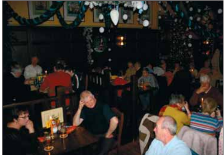
Group members take up their pre-booked places in Maximillians Restaurant

Alexanderplatz, a premier hotel in one of the major squares of Berlin, situated just East of where the Berlin Wall formerly stood. Dusk was setting in as we crossed the River Spree. Our hotel was a magnificent 37 story building; it is only overlooked by the lofty TV tower which stands just a block away. The view of the city of Berlin, seen from the platform of the TV tower at 268.2 metres, has to be experienced to be appreciated.