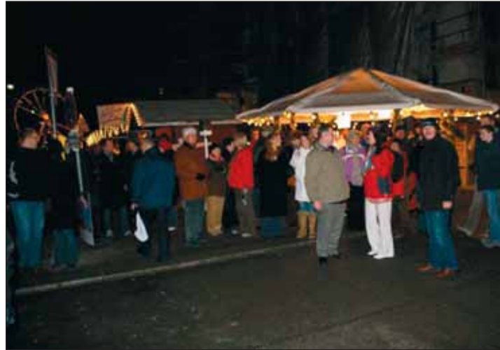
Group members get their first taste of Berlin's Christmas Markets

As for the Schnitzel, the huge portions served had a few struggling to clear their plates. Have you ever thought how bizarre it is that no matter how full you may be with the main course, room always becomes available for the desert? Well the rule applied here and an impressive ice cream sundae finished off a great meal. A few more beers and it was time to return; we all arrived together at our destination. A short sojourn in the hotel bar wrapped up another great day in Berlin. A brisk walk on Sunday morning brought anyone who wished to a lovely little church not too far from the hotel. Then after breakfast our