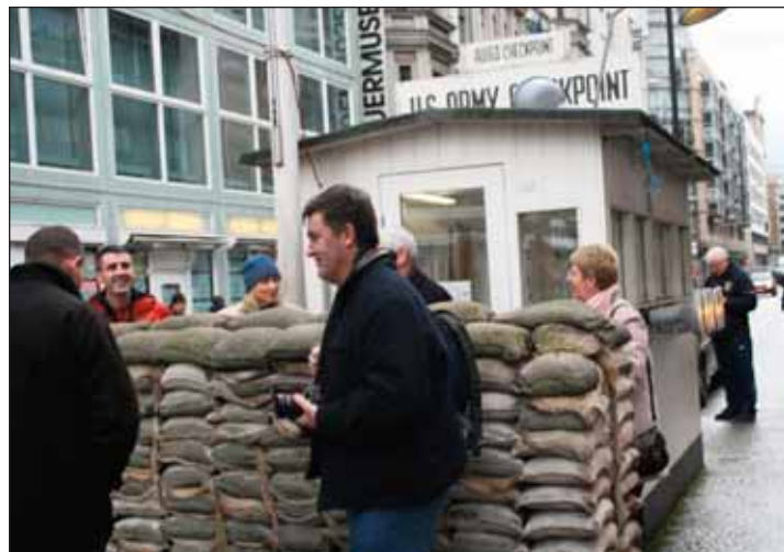
Irish members give Checkpoint the Once Over and think of their own experiences at Border Checkpoints

coach arrived to bring us along the East Side Gallery for a last opportunity of getting photographic evidence of our visit to the Berlin Wall. Next stop, the airport and an uneventful Aer Lingus flight back to Dublin.